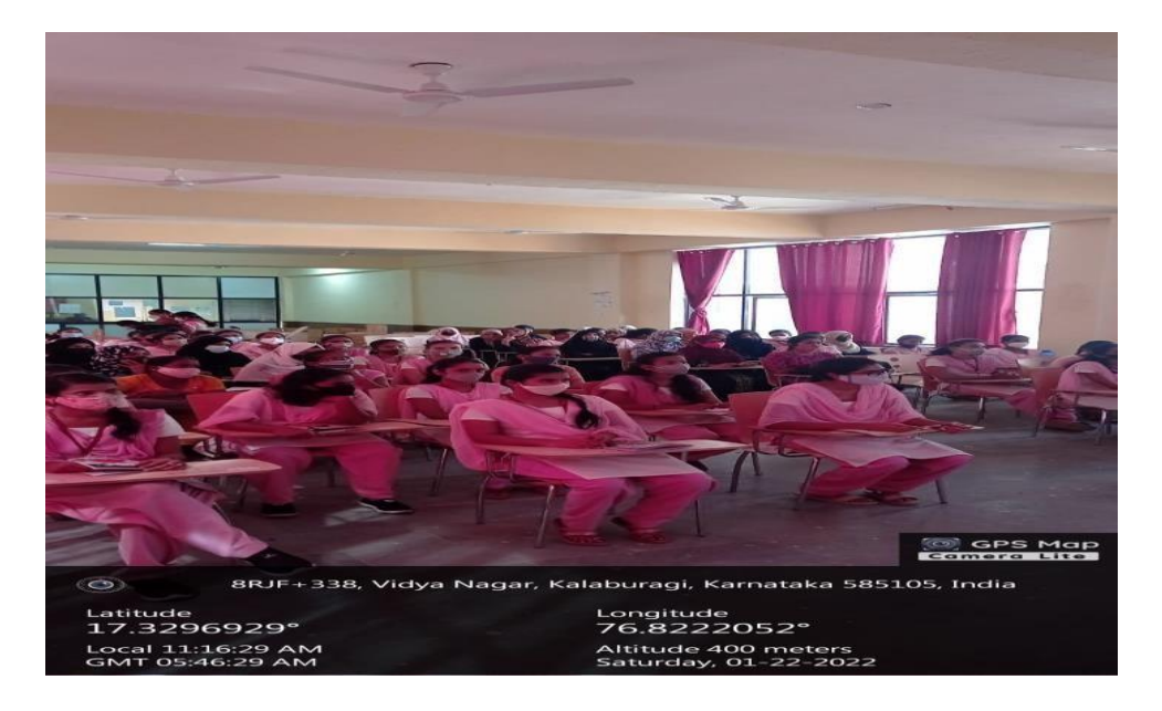
Participants attending the Webinar